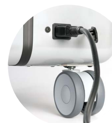
central power supply with protective cap