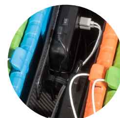
2x MC10 Multi-Charger provides power for all devices