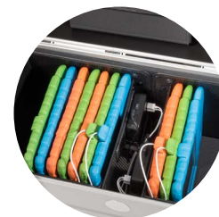
2 big pockets without separators for 10 KidsCovers each